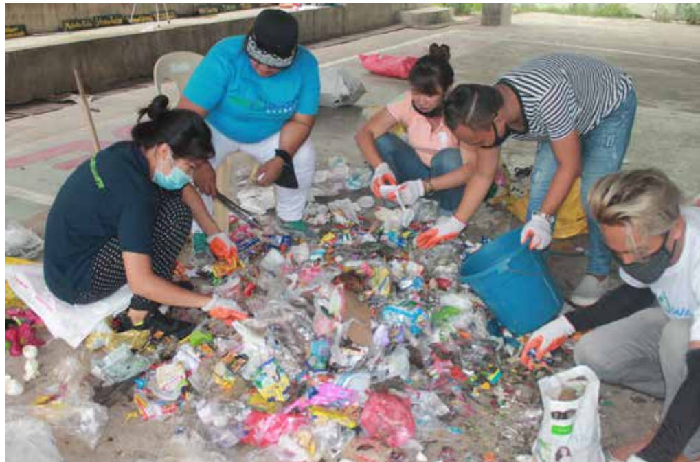
Mother Earth Foundation staff and volunteers conduct waste assessment and brand audit.

Sorting waste into at least four categories makes it easier to manage waste: by composting organic waste; selling recyclable materials to junk shops; treating hazardous waste; and transporting residuals—a fraction of total household waste—to the city landfill. Recyclable waste makes up 15% to 32.5% of the city's total waste volume.