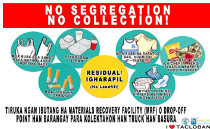
Figure 2. Poster displayed by haulers indicating which articles are classified as residual waste that they can collect.