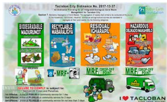
Figure 1. Poster explaining the different waste streams and how they should be handled, as well as the fines imposed for each offense.

is inconvenient or difficult. A typical monitoring visit for the MEF Tacloban team's 11 community coordinators would consist of rummaging through a household's bin and identifying materials disposed in the wrong bin. The staff would also ensure that households avoid