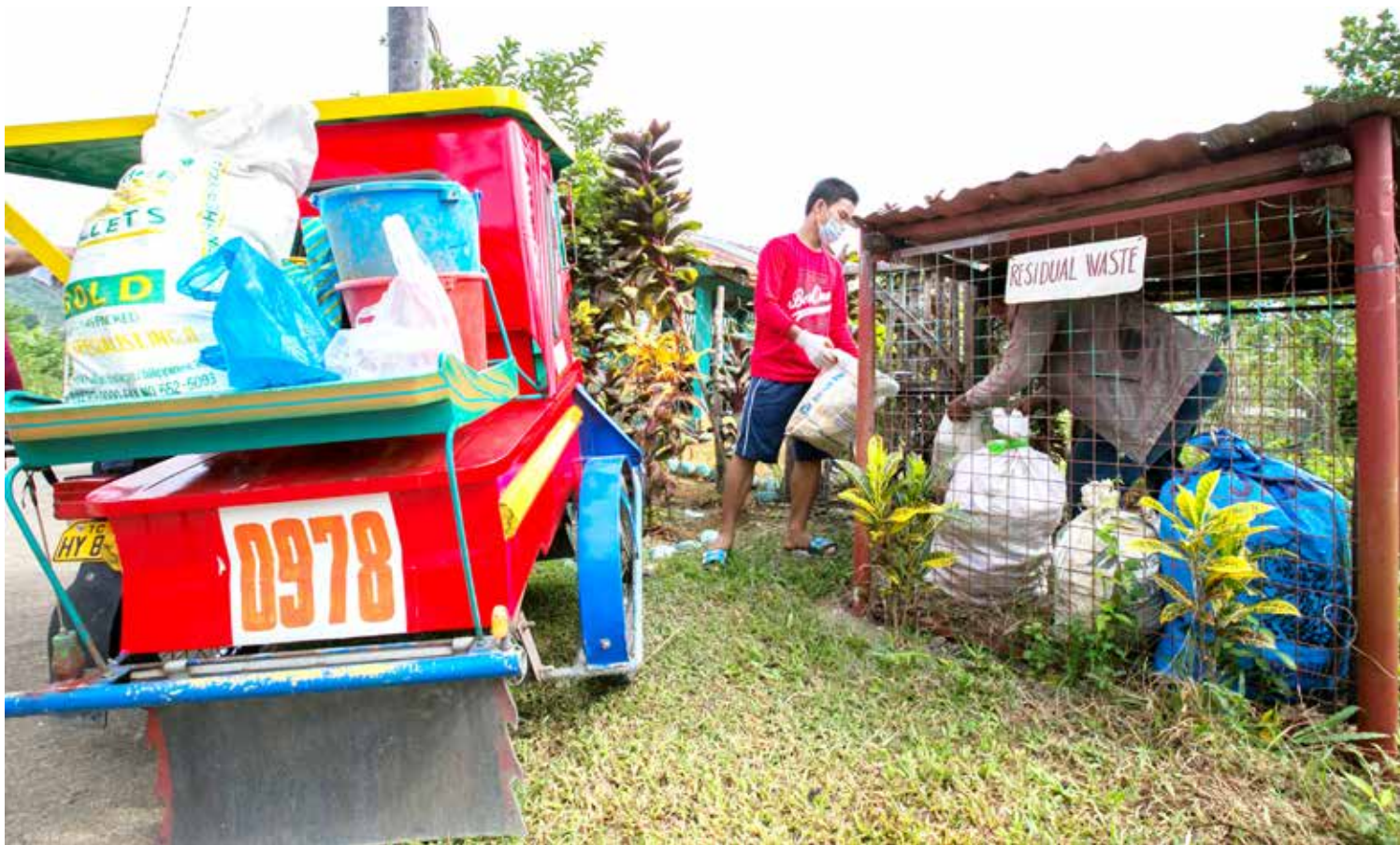
Waste collectors temporarily store residual wastes in an eco-shed in a materials recovery facility in Barangay Sto. Nino.