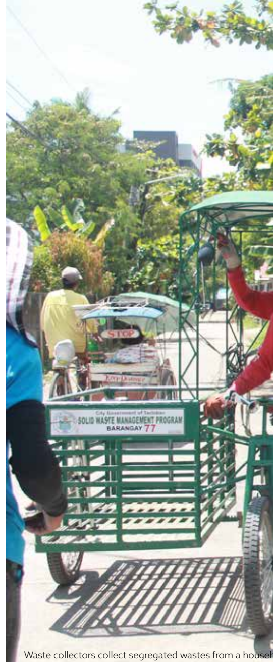
Waste collectors collect segregated wastes from a household.

The key element, however, was the household visits. By the end of the second phase, MEF and CENRO had reached 36,615 households. It was crucial to dispel the notion that segregation